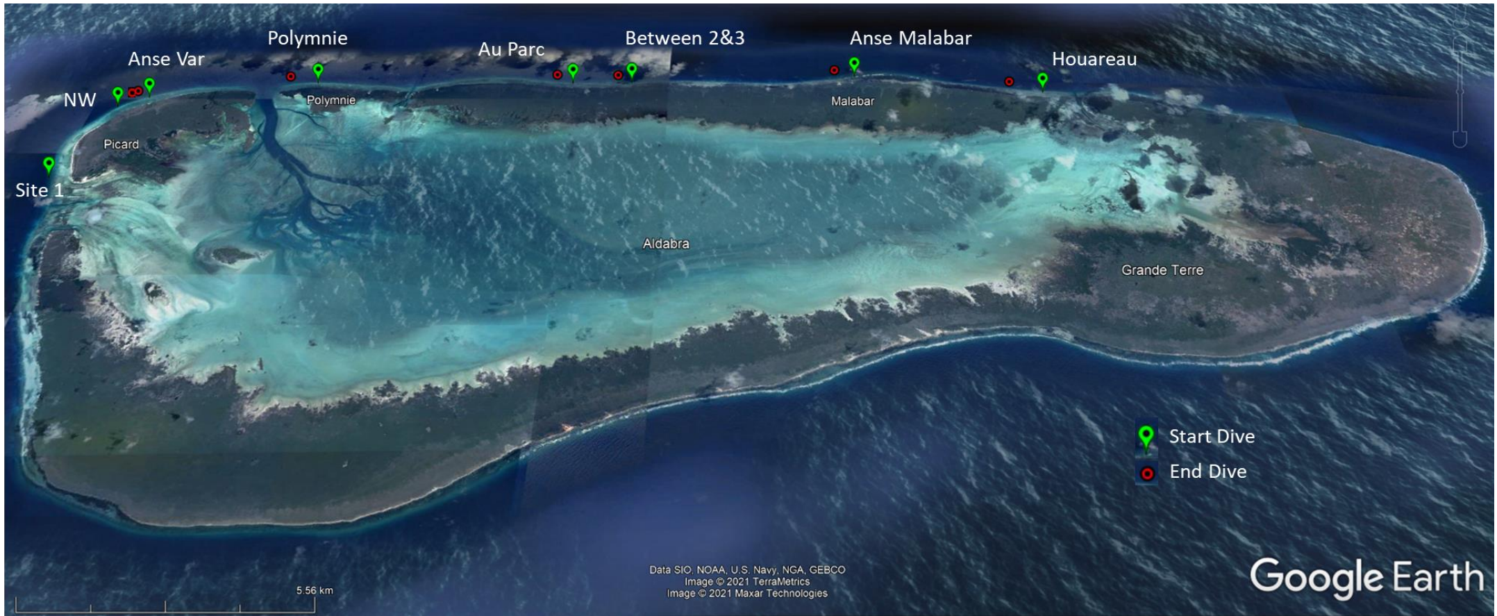
Figure 1. Location of fish list survey sites at Aldabra Atoll.